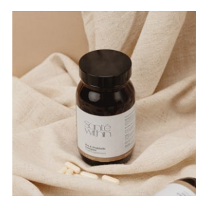
Pre & Probiotic