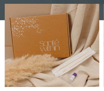
Gut Health Test