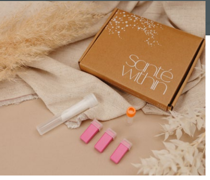
Food Intolerance and Inflammation Test